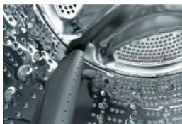
Stainless Steel Drum for Washer